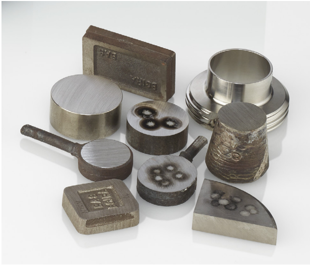
Figure 1: Iron and steel samples