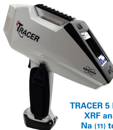
TRACER 5 Handheld XRF analyzer Na (11) to U (92)