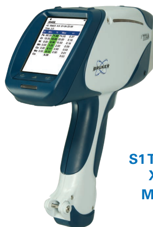
S1 TITAN Handheld XRF analyzer Mg (12) to U (92)

Bruker's two handheld XRF spectrometers, the TRACER 5™ and the S1 TITAN™, are for qualitative and semi-quantitative elemental analysis. They also perform quantitative analysis when utilizing calibrations with like-sample standard reference materials. Results can be given as spectra, composition, or Pass/Fail/Inconclusive for single or multi-elemental analysis of elements from Na to U. A desk or bench top stand with a PC can be used for samples presented in containers such as powders, soils and liquids; small samples; and those which require extended measurements of more than a few seconds.