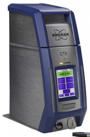
CTX™ Portable XRF analyzer Mg (12) to U (92)

Bruker's portable Counter Top XRF, the CTX™, is for qualitative and semi-quantitative elemental analysis. It also performs quantitative analysis when utilizing calibrations with like-sample standard reference materials. Results can be given as spectra, composition, or Pass/Fail/Inconclusive for single or multi-elemental analysis of elements from Mg to U. The convenient form factor of the CTX is ideal for samples presented in containers such as powders, soils and liquids; small samples; and those which require extended measurements of more than a few seconds.